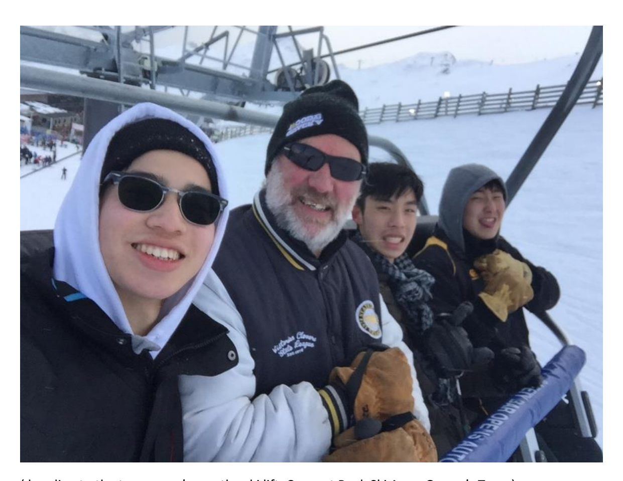
( heading to the top~~~ we're on the ski lift, Coronet Peak Ski Area, Queen's Town)