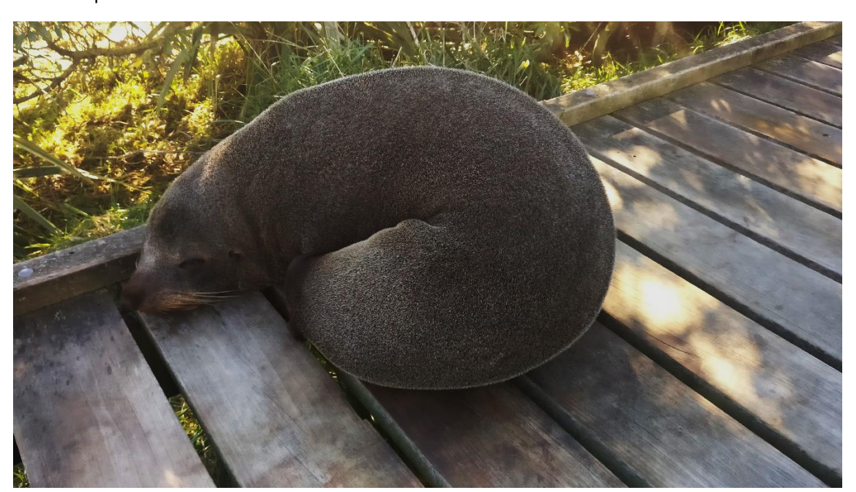
Seal on the boardwalk in Kaikoura