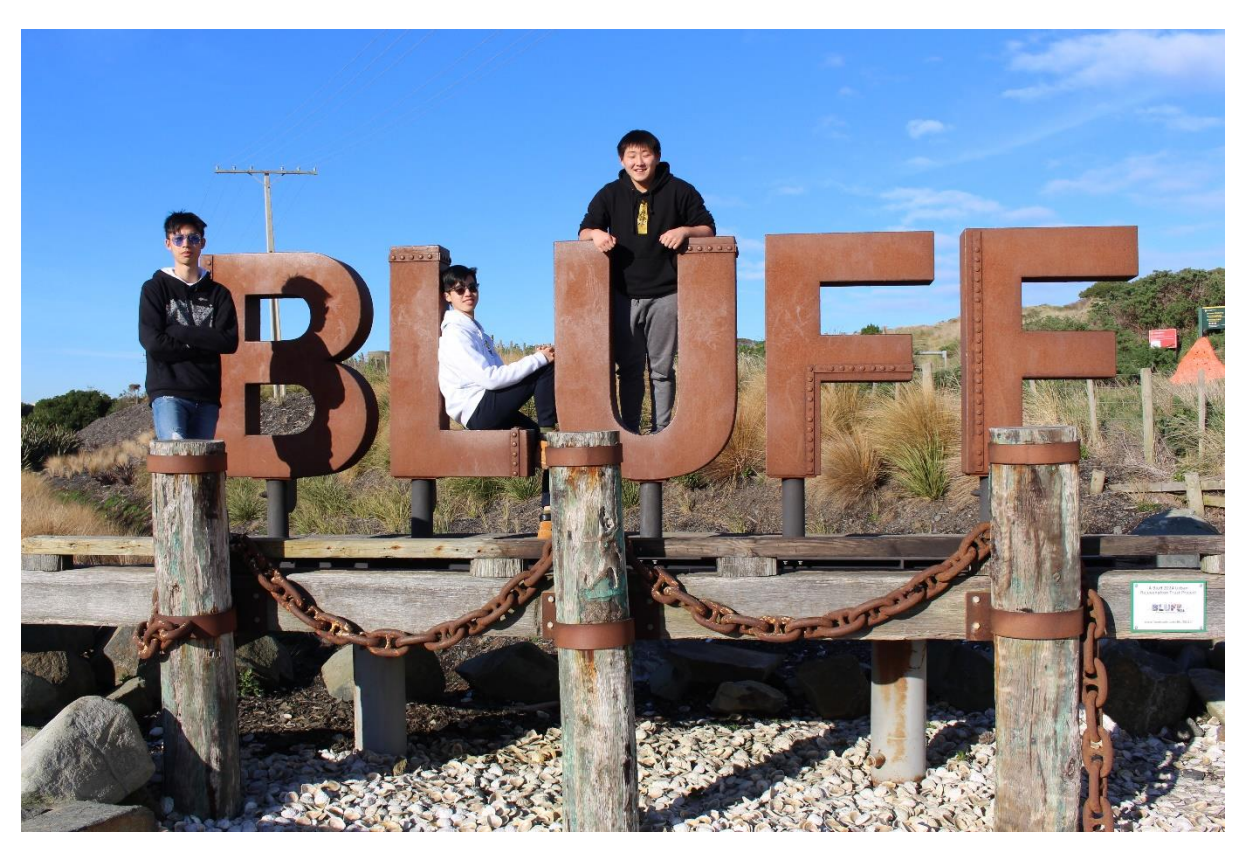
Lounging around at the entrance to Bluff