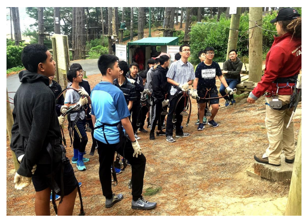
At Adrenalin Forest as part of Orientation Week 2017