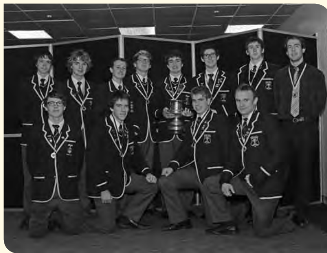
Sports Team of the Year • SENIOR A UNDERWATER HOCKEY