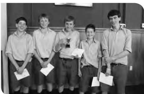
The Junior In-House Champs: The Jems