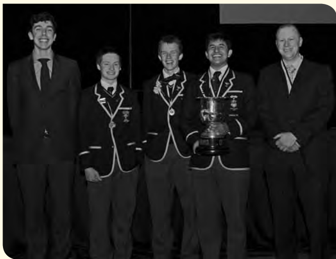
Cultural Group of the Year • SENIOR PREMIER A DEBATING