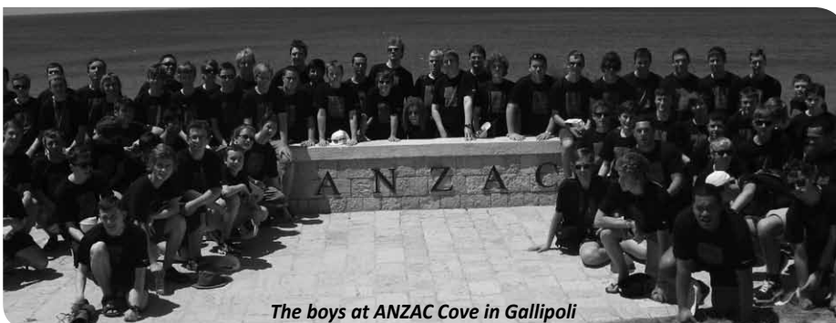
The boys at ANZAC Cove in Gallipoli