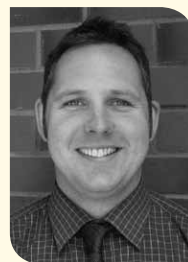
ED WEST History