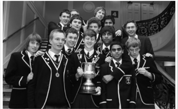
Sports Team of the Year 1st XI HOCKEY