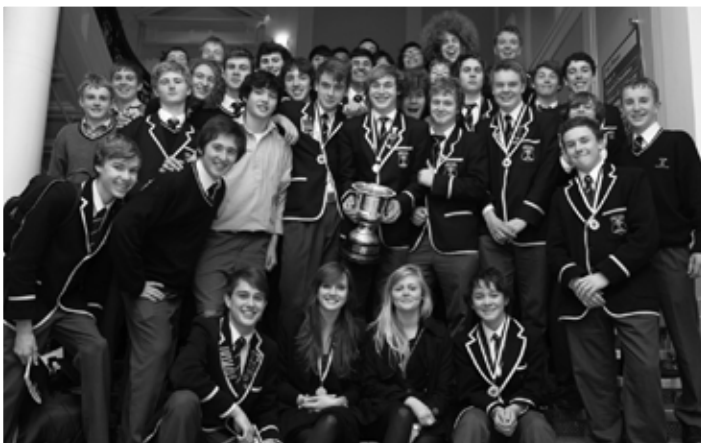
Cultural Group of the Year THE CAST and CREW of JESUS CHRIST SUPERSTAR